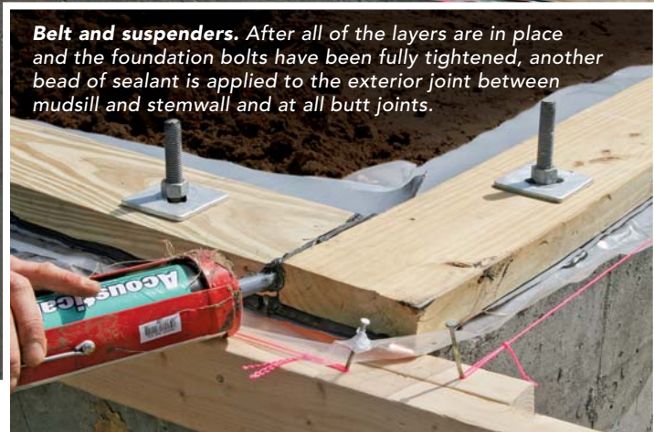
Belt and suspenders. After all of the layers are in place and the foundation bolts have been fully tightened, another bead of sealant is applied to the exterior joint between mudsill and stemwall and at all butt joints.