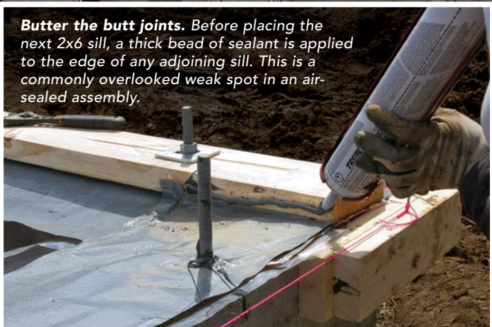
Butter the butt joints. Before placing the next 2x6 sill, a thick bead of sealant is applied to the edge of any adjoining sill. This is a commonly overlooked weak spot in an air-sealed assembly.